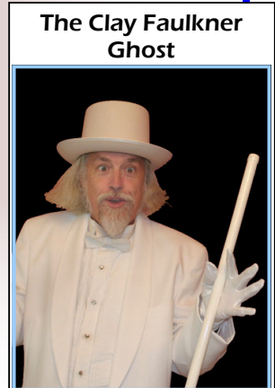
The Clay Faulkner Ghost

Area step-on guide service available — more rib-tickling history stories plus beautiful waterfalls