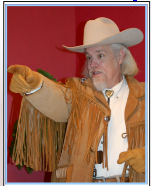
Buffalo Bill Cody

star Buffalo Bill Cody discover which of them is the culprit! Delicious meal and mansion tour included.