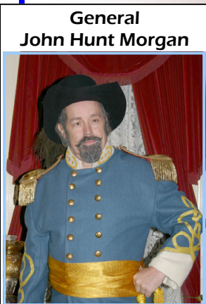
General John Hunt Morgan