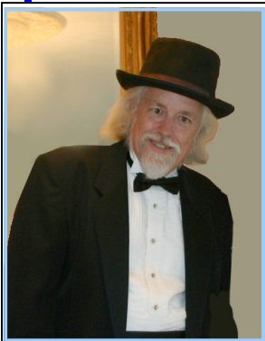
The Victorian Gentleman