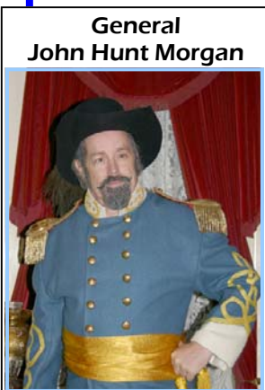
General John Hunt Morgan

It's set at a banquet and ball given to honor the Morgans and ends as 6,600 Union troops attempt to capture the General. The Civil War comes to life.